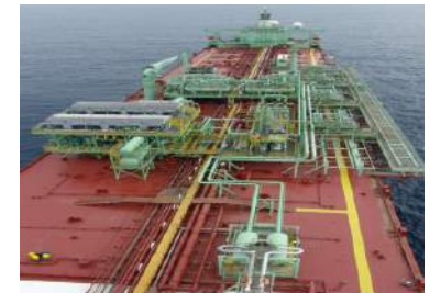
Overview of our OML 126/137 Asset in an environmental friendly platform