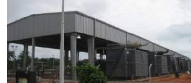
Izombe Gas Compression station- with trees/flowers around it