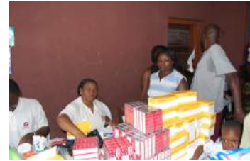
Our Mobile health delivery services