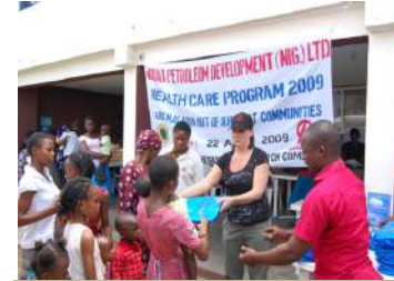
Addax staff distributing insecticide treated mosquito nets to Children