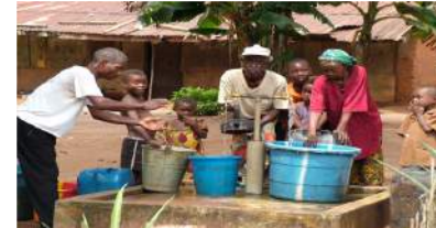
Portable Water Point at Amakpu, Imo state