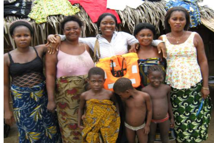
Addax staff (middle) on inspection visit to Effiat (AKS) to see what can be done for the women & children