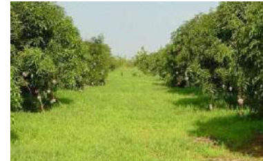
Environmental Protection is our duty not a liability