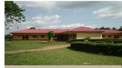
Science block built at Oron