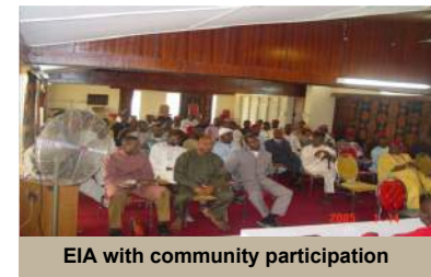
EIA with community participation