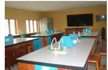
Science Block at Ezioru